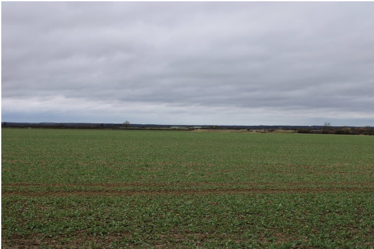
Plate 6 WE5 View from public footpath (Wlbn 15/1), west of Welbourn