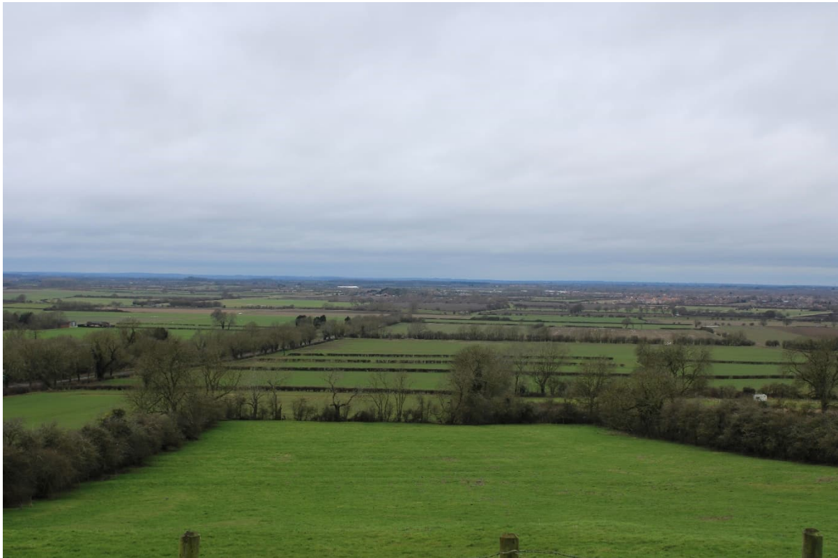
Plate 3 WA2 View from Hill Top, west of Timm's Lane