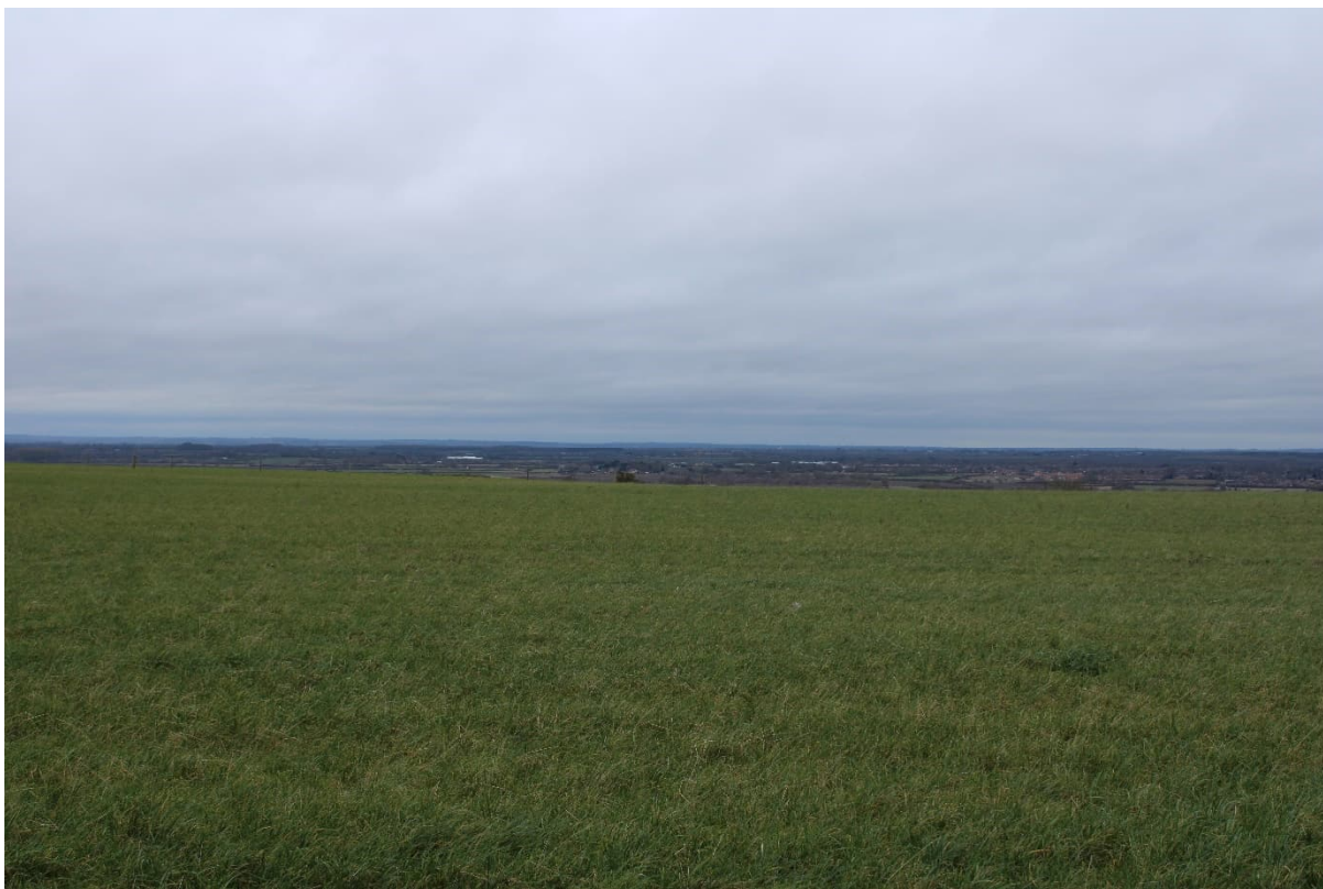
Plate 2 WA1 View from Viking Way (Wdgn 5/2), west of Mettam Road