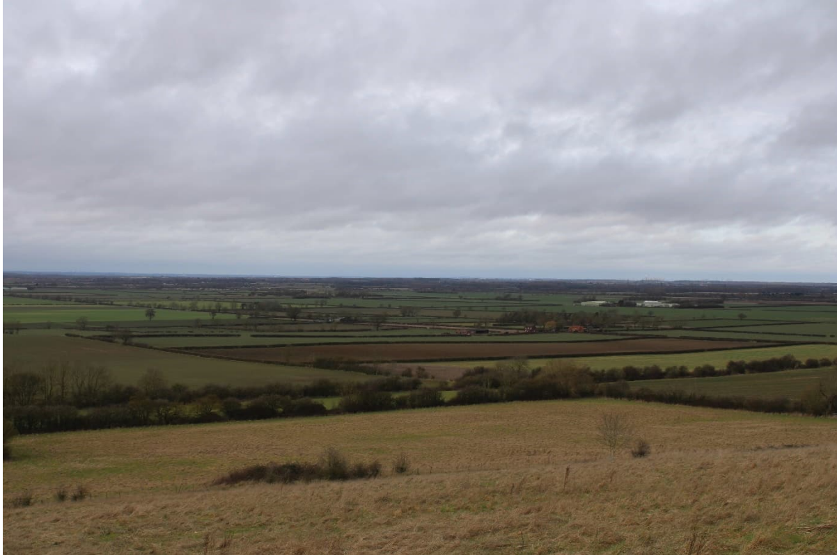
Plate 5 NA4 View from Viking Way (Wlgr 6/1), west of Wellingore