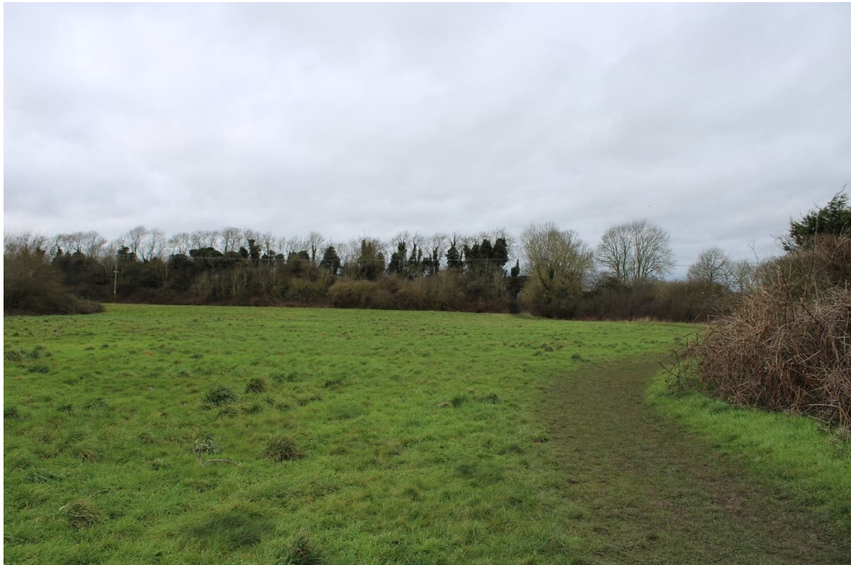
Plate 7 WE6 View from public footpath (Wlbn 17/3), west of Welbourn