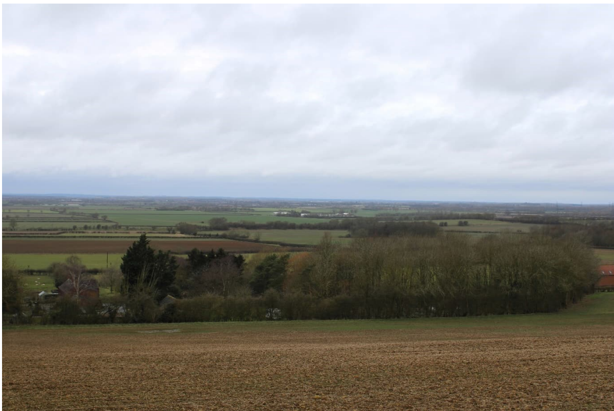
Plate 4 NA3 View from Viking Way (Nave 6/1), north-west of Navenby