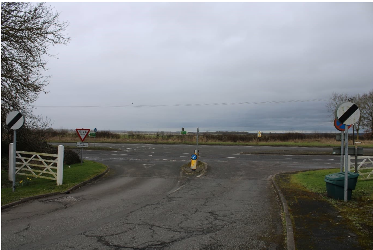
Plate 10 BE9 View from Chapel Street (Beck 4/1) at junction with A17 Sleaford Road