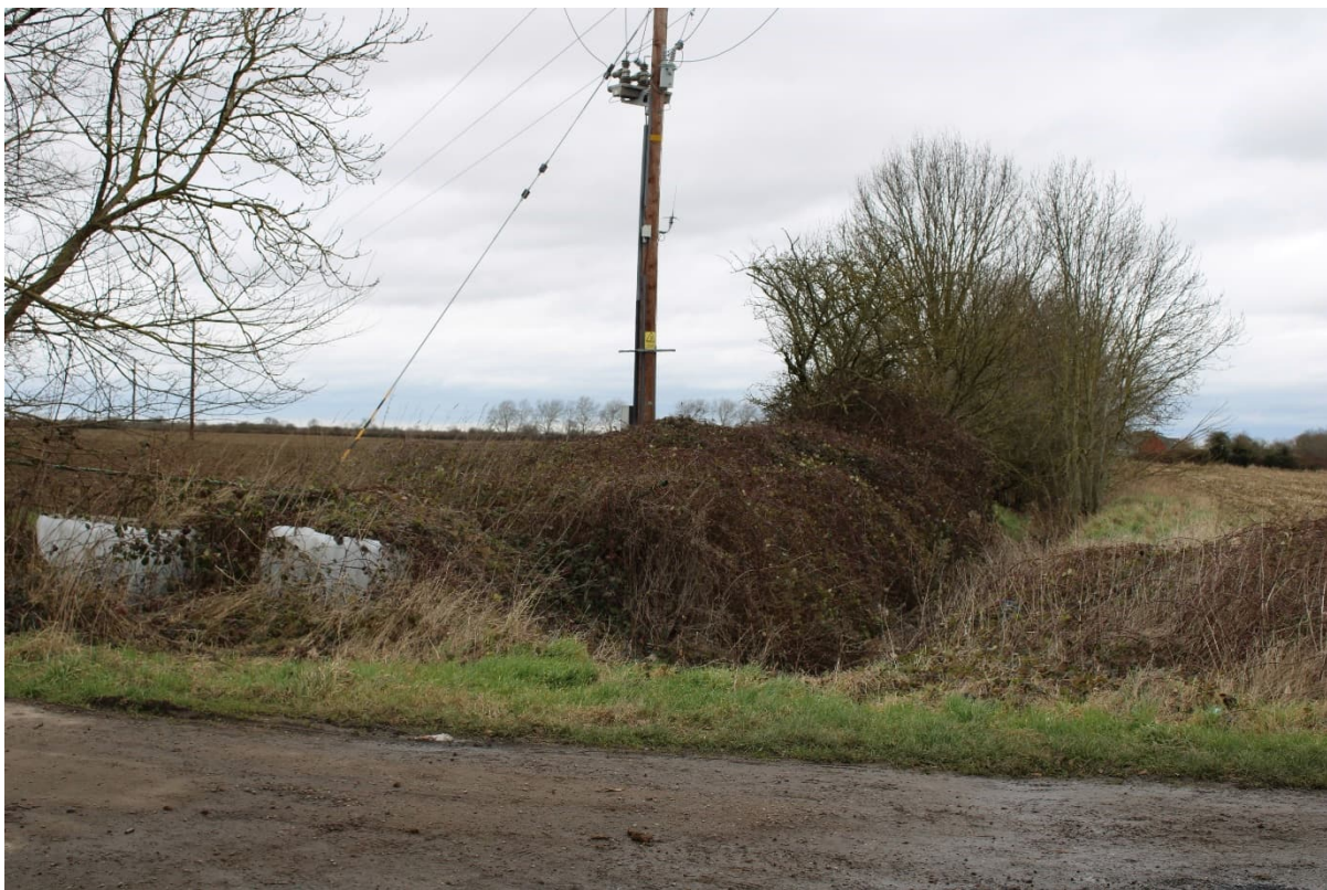
Plate 8 BR7 View from Lincoln Road, north of Brant Broughton