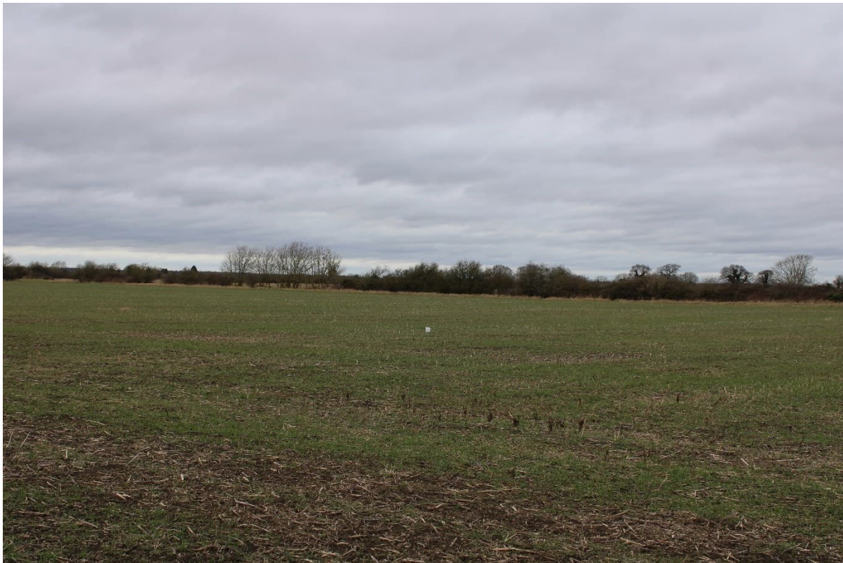
Plate 9 BR8 View from public footpath (BrBS 17/1), north of Brant Broughton